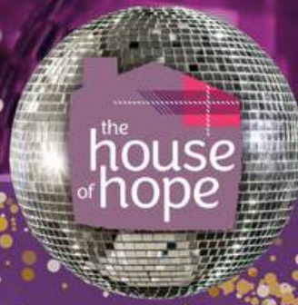
Table for 10 Guests

£1,350 will pay for 100 wellbeing sessions at The House of Hope for someone whose life has been impacted by breast cancer.